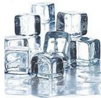
Clear Ice Cubes